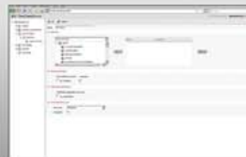
Manage user's connection settings centrally