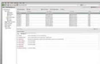
Thin client vendor independent