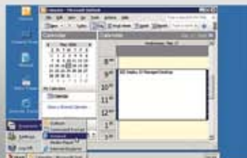
Limit user access to Citrix or 2X published applications