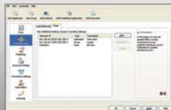
Integration with 2X LoadBalancer Farms