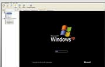
Multiple VDI Providers